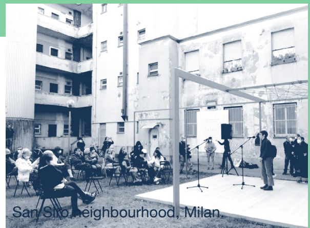
San Siro neighbourhood, Milan.

The Milan workshop will be set in the district of San Siro. San Siro is one of the largest public housing estates in Milan and a large percentage of its population has a migratory background. Despite its physical proximity to the city centre, the area is generally perceived to be part of Milan's periphery due to its challenging material and social conditions, ranging from intense intercultural and intergenerational conflicts to poor buildings maintenance. At the same time, San Siro is also home to a vibrant network of individuals and organisations – known as Sansheros – who collaborate closely to support local residents and ameliorate living conditions in the neighbourhood. Their work of Sansheroes ranges from research-based, policy-oriented initiatives, to the provision of day-to-day services such as legal counselling, language courses, and more. The workshop will engage with the reality of San Siro and its many stakeholders, addressing questions of diversity, cohabitation and care through collaborative storytelling, mapping and scenario building.