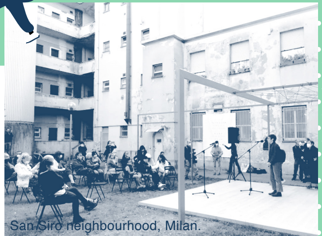
San Siro neighbourhood, Milan.

to a vibrant network of individuals and organisations – known as Sansheros – who collaborate closely to support local residents and ameliorate living conditions in the neighbourhood. Their work of Sansheroes ranges from research-based, policy-oriented initiatives, to the provision of day-to-day services such as legal counselling, language courses, and more. The workshop will engage with the reality of San Siro and its many stakeholders, addressing questions of diversity, cohabitation and care through collaborative storytelling, mapping and scenario building.