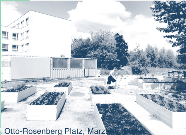
Otto-Rosenberg Platz, Marzahn

livelihoods and the spaces where they live. The workshop will ask how art and architecture can contribute to building local resilience in the context of migration and social exclusion – particularly during the current global pandemic. The workshop will take a collaborative and cross-disciplinary approach, to understand urban space as a product of multiple relationships, and urban practice as an instrument for social change.