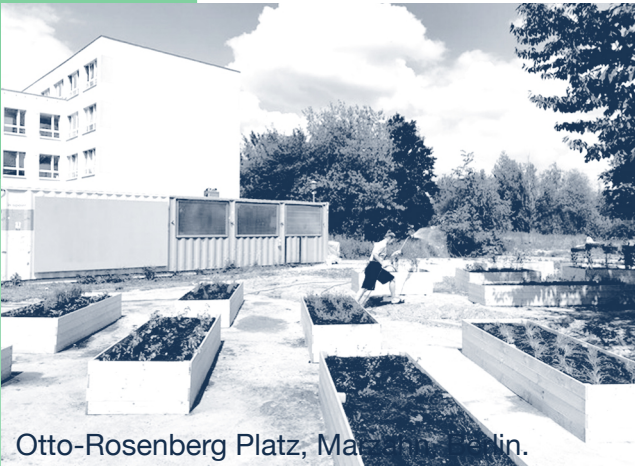
Otto-Rosenberg Platz, Marzahn, Berlin.

Stadtwerke mrzn utilises art-based methods to explore how local residents can gain agency to transform both their livelihoods and the spaces where they live. The workshop will ask how art and architecture can contribute to building local resilience in the context of migration and social exclusion – particularly during the current global pandemic. The workshop will take a collaborative and cross-disciplinary approach, to understand urban space as a product of multiple relationships, and urban practice as an instrument for social change.