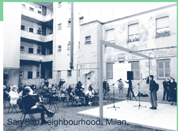
San Siro neighbourhood, Milan.

The Milan workshop will be set in the district of San Siro. San Siro is one of the largest public housing estates in Milan and a large percentage of its population has a migratory background. Despite its physical proximity to the city centre, the area is generally perceived to be part of Milan's periphery due to its challenging material and social conditions, ranging from intense intercultural and intergenerational conflicts to poor buildings maintenance. At the same time, San Siro is also home to a vibrant network of individuals and organisations – known as Sansheros – who collaborate closely to support local residents and ameliorate living conditions in the neighbourhood. Their work of Sansheroes ranges from research-based, policy-oriented initiatives, to the provision of day-to-day services such as legal counselling, language courses, and more. The workshop will engage with the reality of San Siro and its many stakeholders, addressing questions of diversity, cohabitation and care through collaborative storytelling, mapping and scenario building.